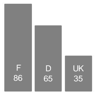
Exh. 1: Uncertainty Avoidance Index according to Hofstede (2005:168f.)

These figures meet with scepticism not only among French experts (Pateau 1999:41ff.) but also in Germany (Jahn 2006:10ff.) as they clearly challenge generally held (stereotypical?) views both in Germany and France.